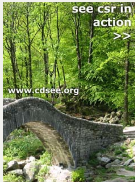
Cover of the CDRSEE's presentation

With corporations in the region increasingly aware and able to meet their responsibilities, and the CDRSEE’s track record of good relations with the private sector, this looks to be a fruitful avenue of collaboration for all parties.