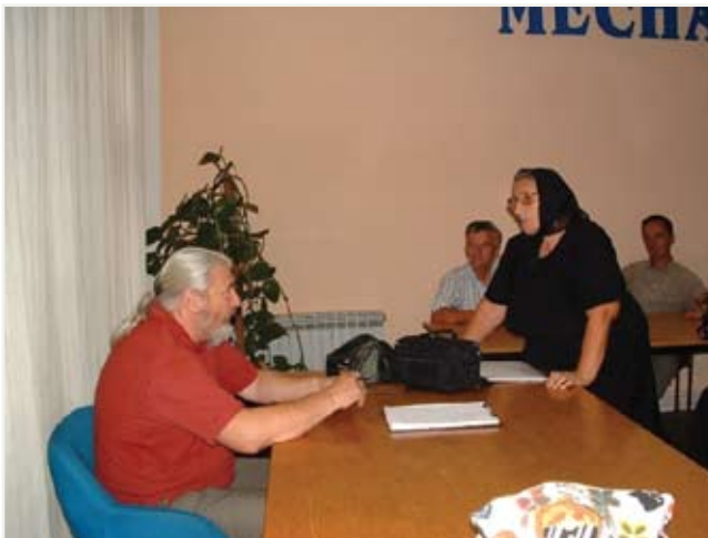
Help desk staff assisting with an enquiry

The helpdesks are facilitated and staffed in the field by the Novi Sad Humanitarian Center, the local partner of the CDRSEE for Employed, Empowered.