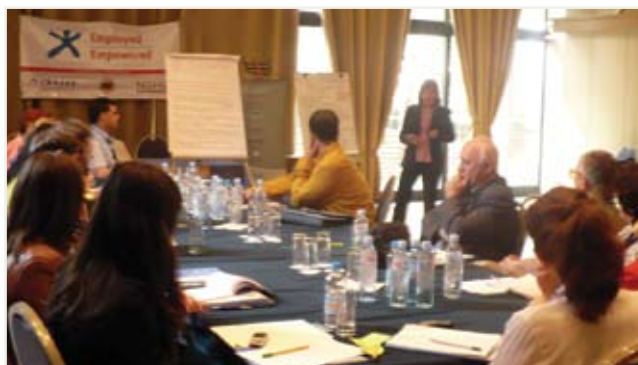
Working group 1 in session