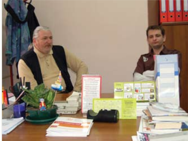
Staff of the Novi Sad Humanitarian Centre working at the helpdesk.